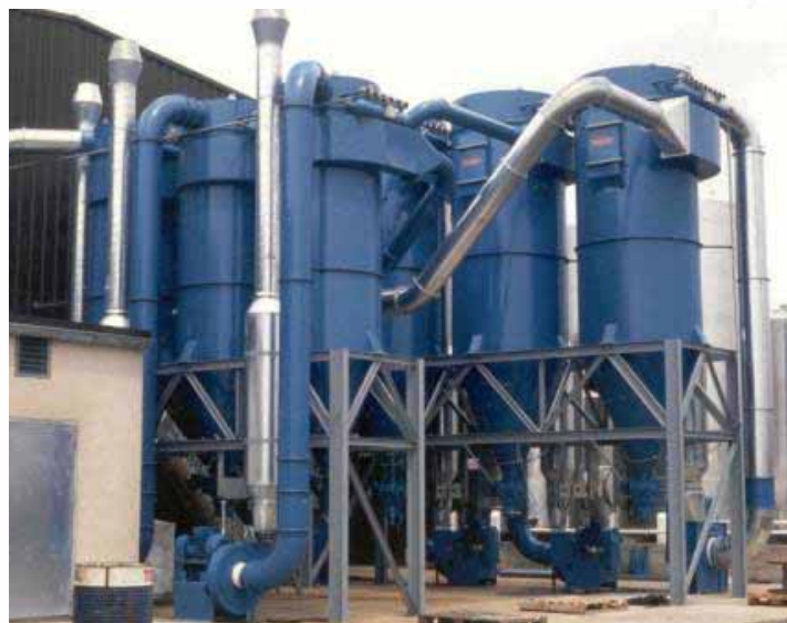
SimPact 4T pulse-jet filters collecting marble, glass, and polyester dust at S.T.D. plant in France

The optional, extended control unit is, however, equipped with a differential pressure transducer displaying the pressure drop by LEDs on the filter control board. The extended control adjusts the cleaning frequency to the actual pressure drop, keeping the pressure drop at a constant level. Thus the consumption of compressed air is minimized and the emission values improved.